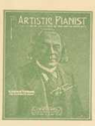
VLADIMIR DE PACHMANN