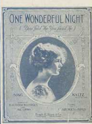
A Wonderful Waltz Song