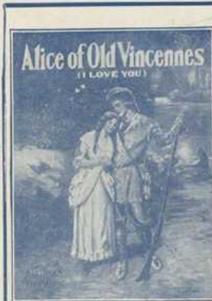
Another "Lonesome Pine"