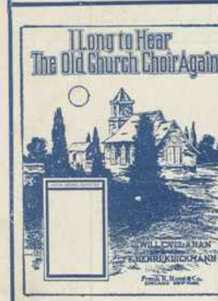
A Beautiful Home Ballad