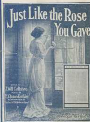
Ballad of Rare Beauty

Complete Copies on Sale Wherever Music is Sold!