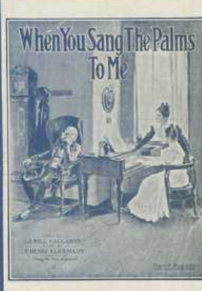
Appeals to Everybody