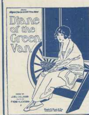
Adapted from $10,000 Prize Novel